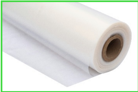
Ecofender™ Newt Barrier Standard Clear