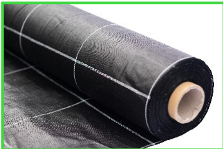
Ecofender™ Newt Barrier Woven