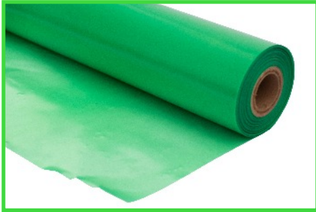
Ecofender™ Newt Barrier Standard Green