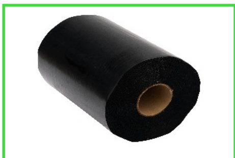
Root Barrier C3 Lapping Tape