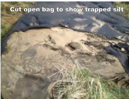
Cut open bag to show trapped silt

Hy-Tex Ultra Dewatering Bags provide an effective way to collect harmful sediments from dirty water pumped out of excavation works (such as foundations, pipe line construction, water, sewer and utility trenches, waterways and lakes) that would otherwise pollute the surrounding environment.